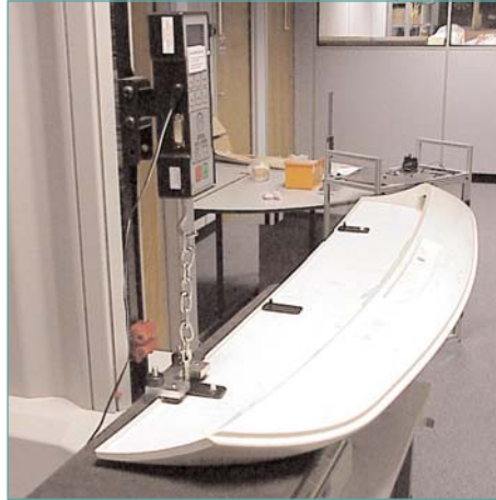
Car trim pull-off test