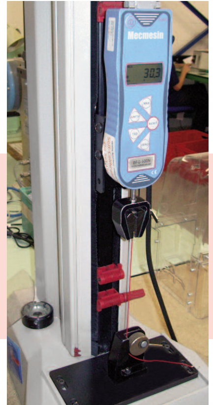
Tensile test on crimp joints of cables